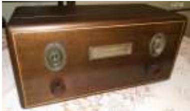
Lot 32: 1927 Radiola 16 : complete with six period 01As, superbly restored $250-380 Picture