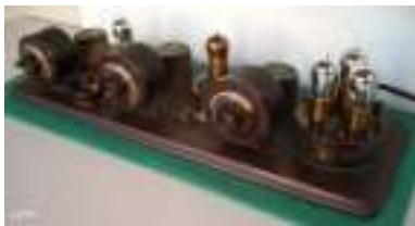
Lot 18: 1924 Atwater Kent model 10B breadboard : fully original example, inspection & warranty tags present & complete, 5 early tipped 01As. $875-1050 Picture