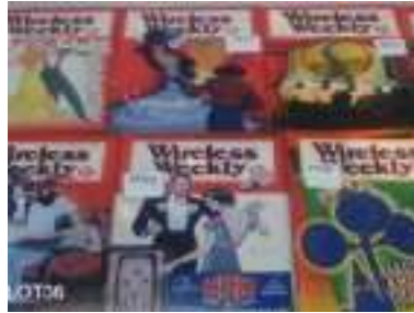
LOTS 35 – 43: Wireless Weekly magazines, 1930 - 1939. A unique collection from estate of a W/W columnist, up until the beginning of Radio and Hobbies . Professionally stored, these remain in pristine condition with sparkling covers. They will be offered in yearly lots. Estimated value per lot $110-160 Picture