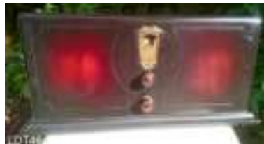
Lot 46: Grand Opera: 4 valve regenerative mains set, timber cabinet, Victorian manufacture, with original brochure $180-350 Picture