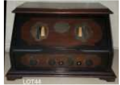
Lot 44: 1925 Radiola 20: All original classic, complete with 5 good UX199s $290-500 Picture