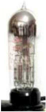
Lot 47A: Loewe 3NF Valve : Spare 'multiple valve'. First integrated circuit! $300-475 (For picture see lot 47) Picture