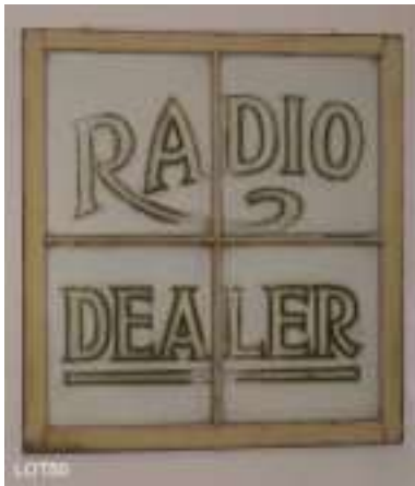
Lot 50: The Burchell Window 90 X 99cm : From 1920s Bowral radio shop. Intriguing full provenance, the centrepiece of several major exhibitions. Value? No precedent. Picture