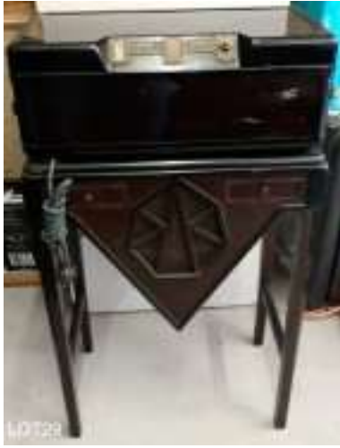
Lot 29: Philips Model 2510/Philips Speaker Stand : Fine display piece $425-575 Picture