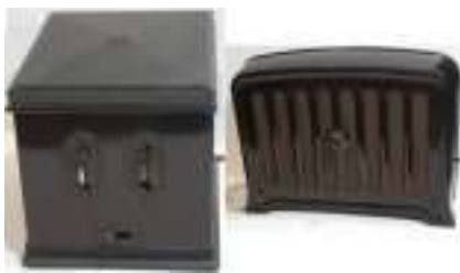
Lot 9: 1928 Telefunken Arcolette w/rare matching speaker: the radio is often seen, the speaker very rarely. $400-600