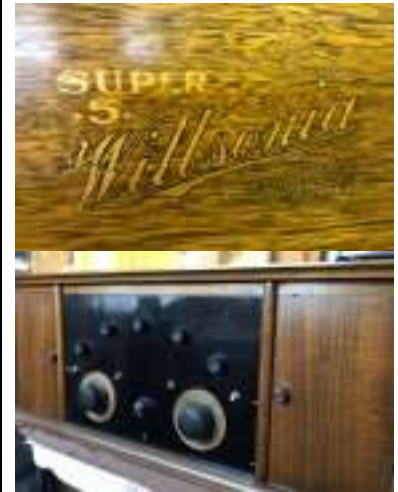
Lot 8A: 1926 Willsonia Super 5 : One of two known examples of model S53 from Tas. Radio Pty Ltd of Launceston. Restored, complete with period valves and P/S. Full provenance in R/Waves, April 2003. $350-550