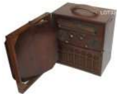
Lot 33: 1925 Radiola 26 : early s/het portable, with power supply, $425-600 Picture