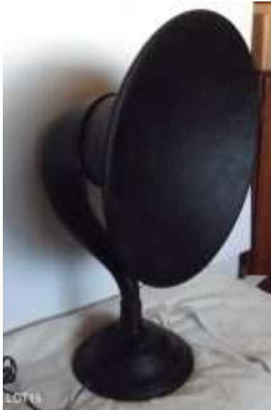
Lot 15: 1924 Atwater Kent Model M Horn : best of A-K horns, & companion to breadboards $200-400 Picture