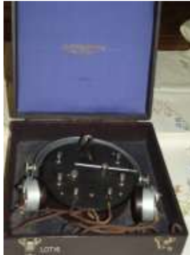
Lot 16: 1925 Astrophone Crystal Radio : Deluxe case, with headphones. Made by British Amplifiers Ltd. $190-325 Picture