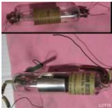
Lot 10: Audions X 2 : very early (teens) and very rare. $60-100 ea.