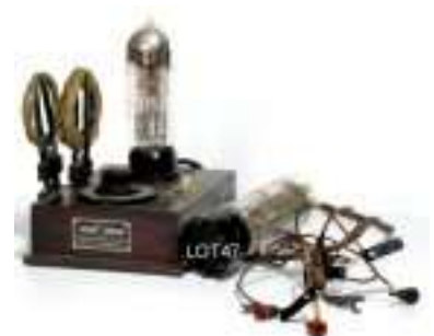
Lot 47: 1926-7 Loewe 3NF Receiver: With classic 3-in-one valve, a rare good original piece of history. $525-700 Picture