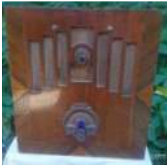
Lot 7: 1934 Genalex 'Dapper' Five : w/original working Catkin valves $275-350