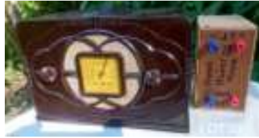
Lot 30: 1939 Astor Mickey EG : Battery version of model EC, original and with purpose-built power supply. Working $350-500 Picture