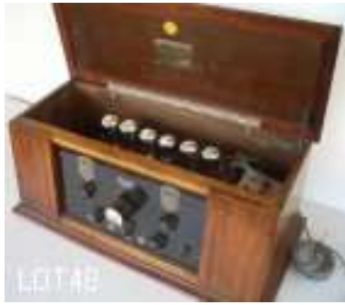
Lot 48: 1926-7 AWA Standard Six : fine example of early AWA classic, complete with 6 period 01As, rare filament voltage meter, and power supply $480-750 Picture