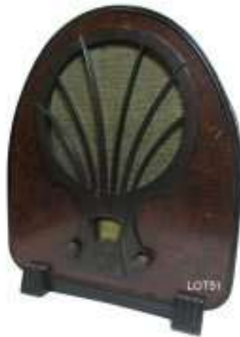
Lot 51: 1931-2 Philips 830A : Lovely example of this model $475-750 Picture