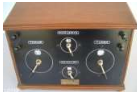
Lot 13: 1923 Michigan MRC10 1 valve : double variometer tuning, unique panel $200-325