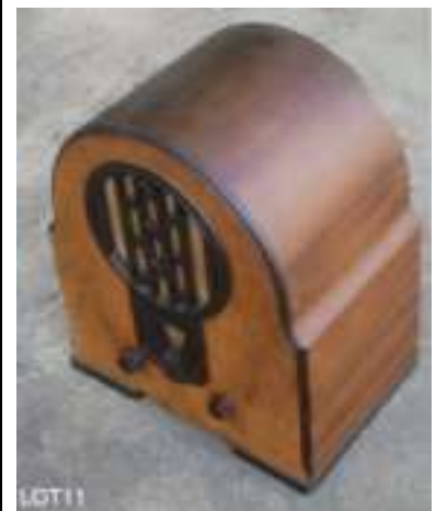
Lot 11: 1934 Philips 5 Valve Super Inductance cathedral : superb TRF $375-550