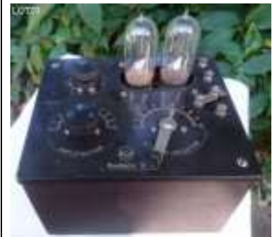
Lot 20: 1924 Radiola III : w/display BBT WD11 valves, $220-360 Picture