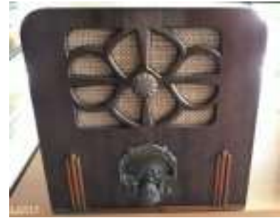
Lot 17: 1930s Gem Timber Mantel : unusual, neat, w/original timber knobs $300-450 Picture