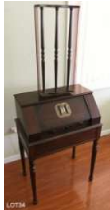
Lot 34: 1926 Radiola 28 : with loop antenna, on elegant battery box table $600-850 Picture