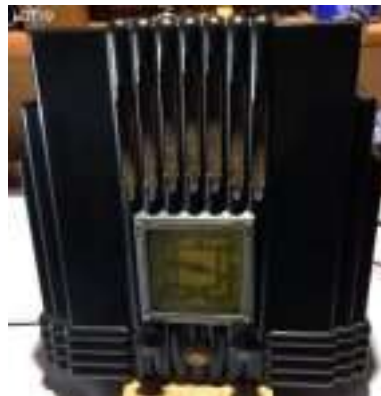
Lot 19: 1934 AWA Radiolette model R28 , black: as seen, working, $475-675 Picture