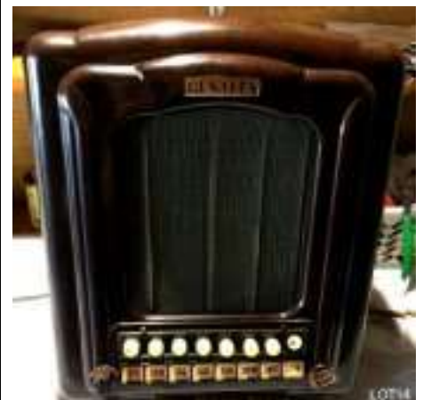
Lot 14: 1936/7 Genalex 600 series : push-button tuning, NSW stations $400-625