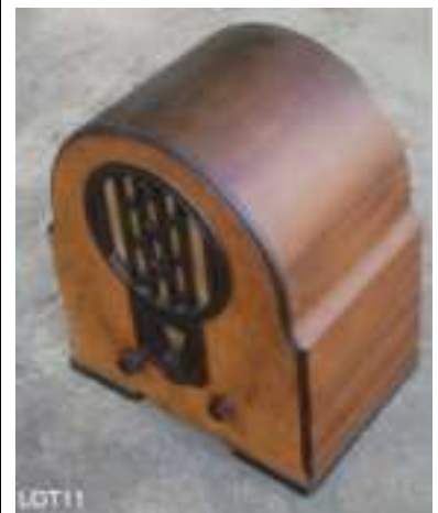
Lot 11: 1934 Philips 5 Valve Super Inductance cathedral : superb TRF $375-550