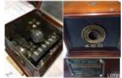
Lot 31: 1927 4QG Microphone Amplifier : from STC London. A unique item from the beginnings of station 4QG. Great paper provenance & real history. $325-500 Picture