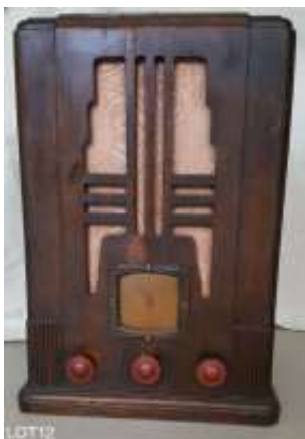
Lot 12: National Matsuba NR 48 110v : rare early Japanese radio. Not working. $100-225