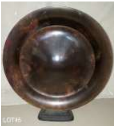
Lot 45: Late 1920s Philips PCJJ Speaker: Mottled Bakelite, working. $200-450 Picture