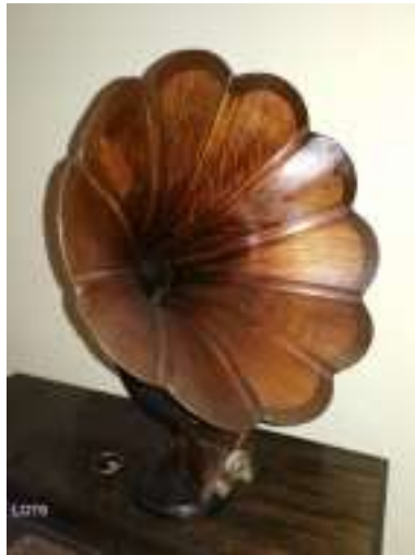
Lot 8: 1925 Amplion Dragon AR 19 horn : Immaculate flare, lovely shape $180-350